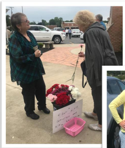
Above: Father's Day Carnation sale.