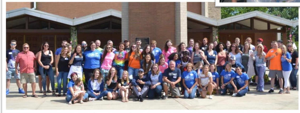
Above: Celebrate Reunion

"Most High glorious God, enlighten the darkness of my heart. Give me true faith, certain hope, and perfect charity, sense, and knowledge, Lord, that I may carry out your holy and true command." Prayer before the Crucifix - St. Francis of Assisi