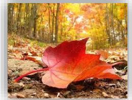
Below: Trunk Sale and Car Wash